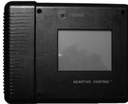
Figure 1 - Operator interface