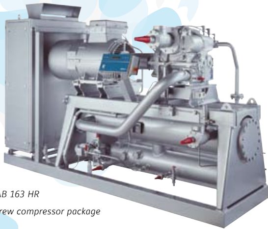
SAB 163 HR screw compressor package

Rotatune variable-speed screw compressor packages are based on the well-proven SAB 128 and 163 Sabroe screw compressors.